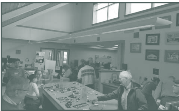
As a sign of our appreciation for our members we had a variety of gifts.