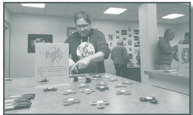
The fidget spinners were especially popular with the "younger" crowd.